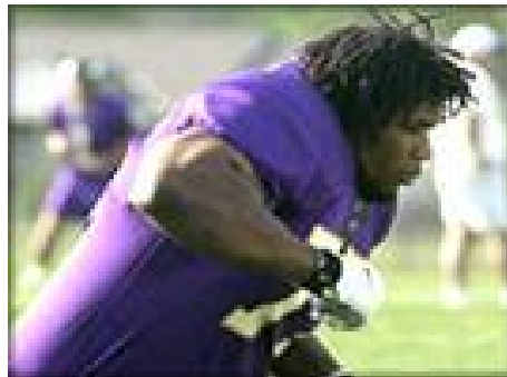
Minnesota Vikings tackle Corey Stringer died during an early training camp practice in July 2001 after suffering heat stroke.

In July 2001, Corey Stringer, a 27-year old Pro Bowl tackle for the Minnesota Vikings, collapsed from heat stroke during an early training camp practice held during a heat spell when temperatures were in the 90's by mid-morning. His body temperature had climbed to 108 degrees by the time he was hospitalized, and he died early the following morning from cardiac arrest brought on by multiple organ failure. 64